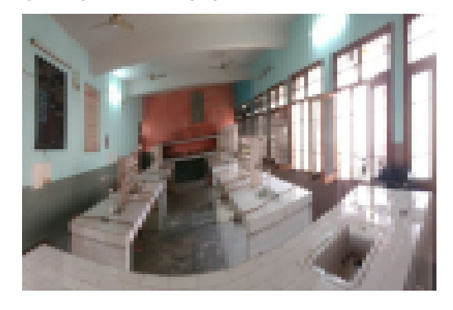
BIOLOGY LAB PHOTO